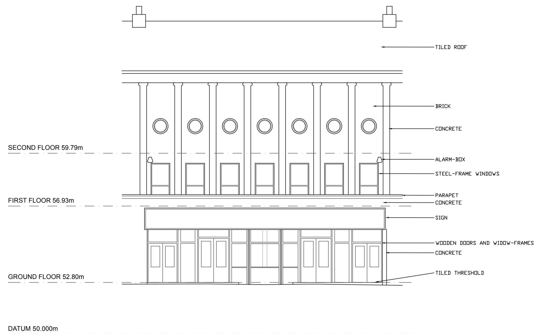
FRONT ELEVATION (SOUTH-WEST)