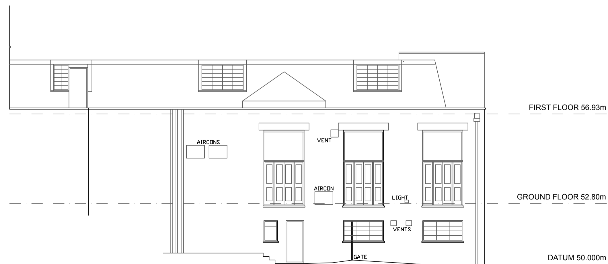
SIDE ELEVATION (SOUTH-EAST)